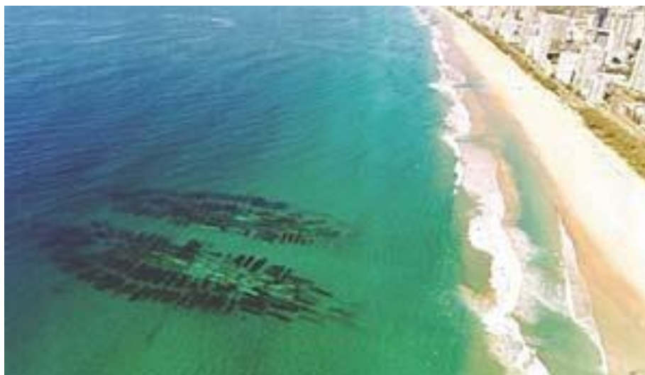
Figure 3: Narrowneck artificial reef, northern Gold Coast, Australia

Recent erosion events have again focused attention on repair options for Gold Coast beaches and two recent studies have attempted to provide economic evaluations of beach nourishment works. Cooper and Lemckert (2012) estimated the cost of nourishing Gold Coast beaches to offset shoreline recession due to a 1m rise in sea-level by the year 2100 to be AUD$11 million. However, this estimate seems conservative compared to recent estimates by Gold Coast City Council (2013) that it would cost AUS$20 million dollars to protect beach amenity in the region for only 30 years. Raybould and Anning (2014) conducted analysis of this proposed AUS$20 million beach nourishment project for northern and central Gold Coast beaches. Based only on avoided loss of recreation and tourism values they estimated benefit-cost ratios of 3.82 for the project at a 5 per cent discount rate.