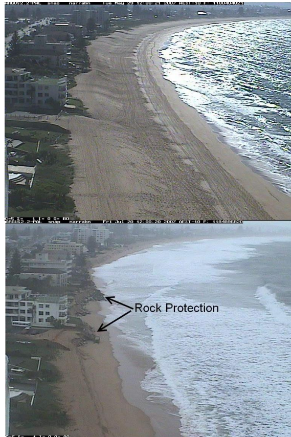
Figure 2(a): Wide beach at Collaroy. Image taken at 12pm, May 29, 2007. Figure 2(b): Narrow beach at Collaroy. Image taken at 12pm, July 20, 2007.

Rock protection clearly exposed. (Source: Water Research Laboratory [WRL], 2007).